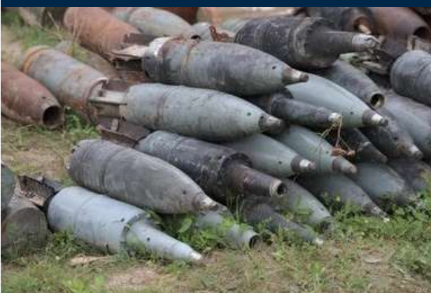
Unexploded Ordnance (UXO)