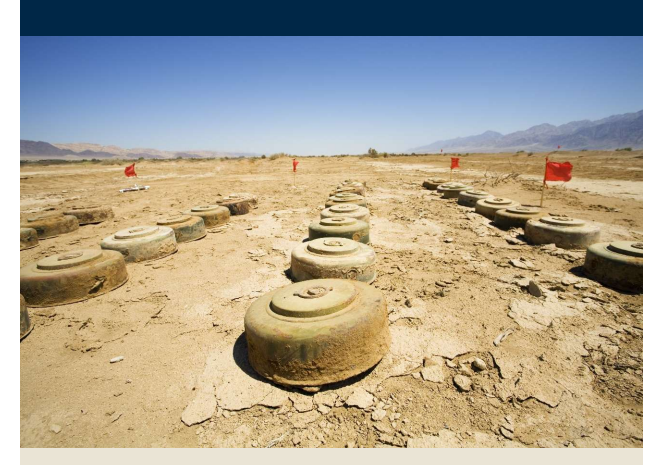
Landmines Sea Mines