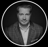
GEORGE KURTZ Co-Founder & CEO